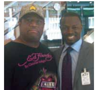
SEAN PATRICK THOMAS